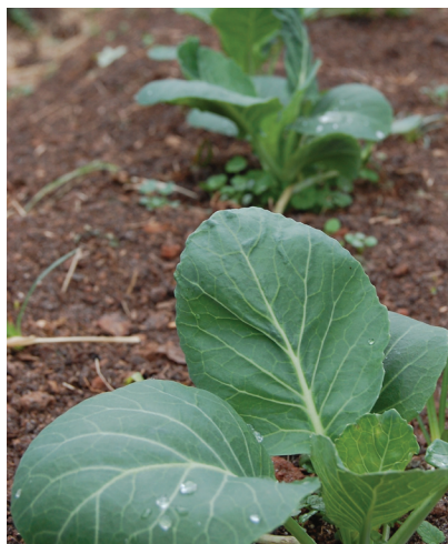
Chinese Cabbage

Permaculture is a word that seems to be catching on like wildfire at Koinonia. We hear it in conversations at the lunch table, in the office, and around the farm. We wrote about it in our last newspaper, in our e-news updates, and we’re hosting a Permaculture design course in February. But we know some major questions still exist, like: What exactly does Permaculture mean? How does Koinonia plan to use this concept to re-define and re-vision the plant, animal, and human life on our farm?