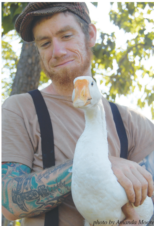
All grown up, adult goose taken September 2008

When you come to the farm, be sure to come by the barn! You'll see Clarence the bull, over a dozen goats, two pigs, and 60-some chickens. We might even have the heifer and calf by then. On the way to the barn, you might cross paths with some of the free-range chickens, the flock of geese, and guineas. Make sure to stay a good distance from the two hives of Italian bees—don't worry, they're marked!