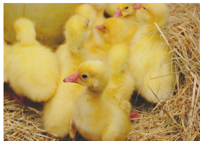
Baby geese, taken April 2008

When you come to the farm, be sure to come by the barn! You'll see Clarence the bull, over a dozen goats, two pigs, and 60-some chickens. We might even have the heifer and calf by then. On the way to the barn, you might cross paths with some of the free-range chickens, the flock of geese, and guineas. Make sure to stay a good distance from the two hives of Italian bees—don't worry, they're marked!