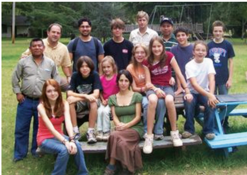
Students, teachers and friends with visitors from El Salvador.